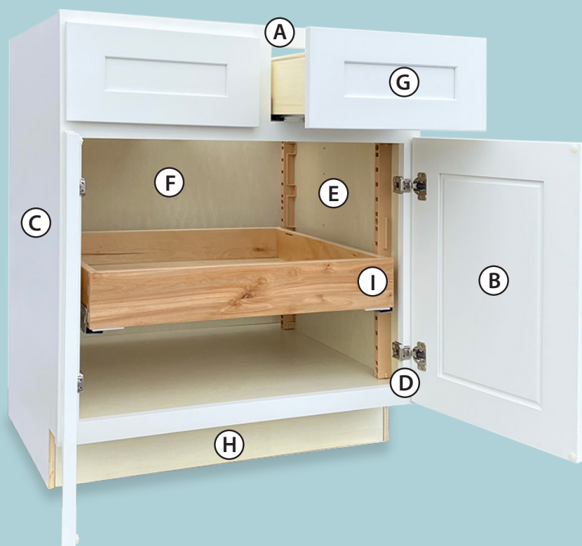
(top of base cabinet)